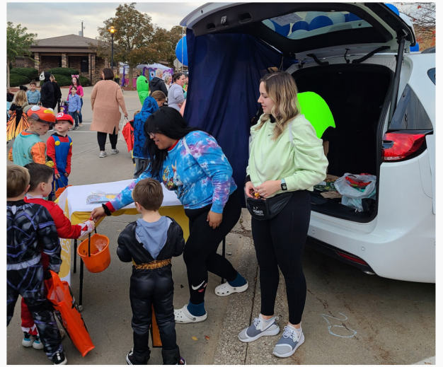
Above: our Ankeny campus participated in Uptown Ankeny's Trunk-or-Treat event where they connected with over 1000 friends for a FIN-tastic evening of Halloween fun! Middle: the Ankeny team enjoyed spirited fun with theme days and fun in the gym. Bottom: Waukee's Halloween party was a blast, promoting skills, sensory-friendly fun, and beyond!